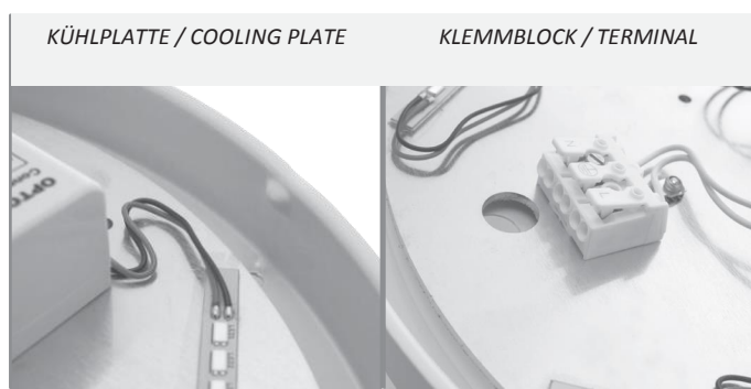
KÜHLPLATTE / COOLING PLATE